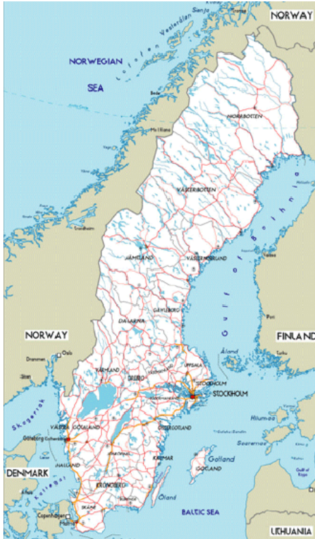
Figure 7: Map of Swedish Road Network

The Swedish road network consists of high-quality public roads—primarily motorways (National highways) and dual carriageways (divided highways)—that connect major urban centers in the south and private rural roads that connect disparate villages in the more forested regions in the north. The network consists of 139,000 kilometres of public roads and 75,000 kilometres of publicly-funded private roads.