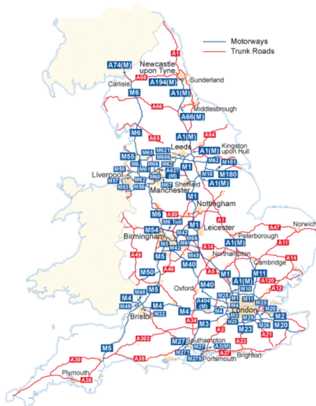
Figure 11: Great Britain Road Network

The minor roads (or category B and C roads) comprise 338,000 kilometres, amounting to 87% of the total. Motorways and A roads (non-trunk roads) account for 1% and 12% of the road network respectively (See Figure 11 ) (DFT, Transport Statistics Bulletin, 2005).