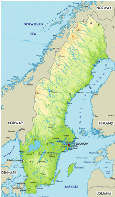
Figure 6: Map of Sweden

Sweden is located in northern Europe and is situated within the Scandinavian Peninsula, which it shares with Norway. Despite the size of its landmass, measuring 450,000 square kilometres, Sweden has a relatively low population density at approximately 9 million inhabitants. It is bordered to the North by the Gulf of Bothnia and the Baltic Sea.