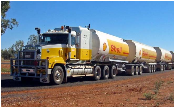
Figure 3: Australian Road Train

The types of trucks used for transport in Australia are similar to those found in Canada: rigid trucks and articulated trucks. Another commonality is the use of road trains—known in Canada as longer combination vehicles or LCVs. Road trains are articulated trucks with two or more trailers (see Figure 3 ). B-doubles, common in Australia, are road trains with a prime mover or truck tractor and two additional trailers.