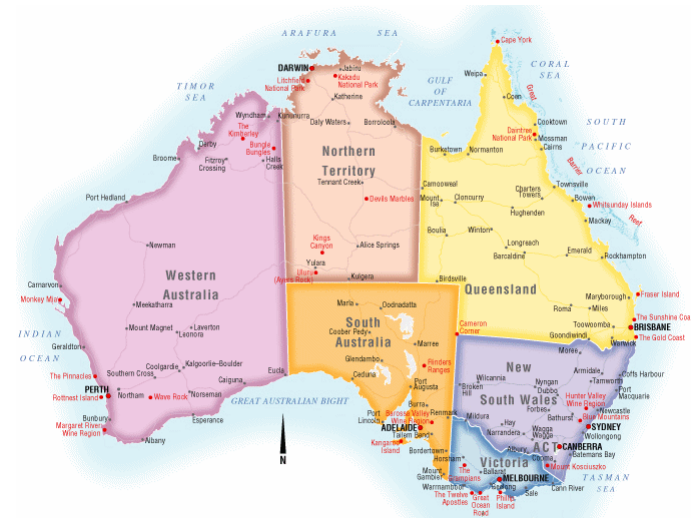
Figure 1: Map of Australia

Australia consists of six states: New South Wales, Queensland, South Australia, Tasmania, Victoria and Western Australia. It also has two mainland territories: the Northern Territory and the Australian Capital Territory.